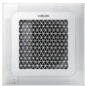
Windfree Mini 4-way Cassette

REFERENCE LINK: https://albertaindoorcomfort.com/calgary-hvac-ac-replacement/